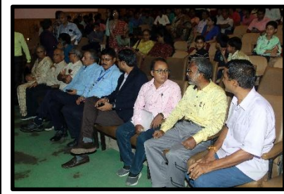
Photo Gallery : Felicitation & Lighting of the Lamp