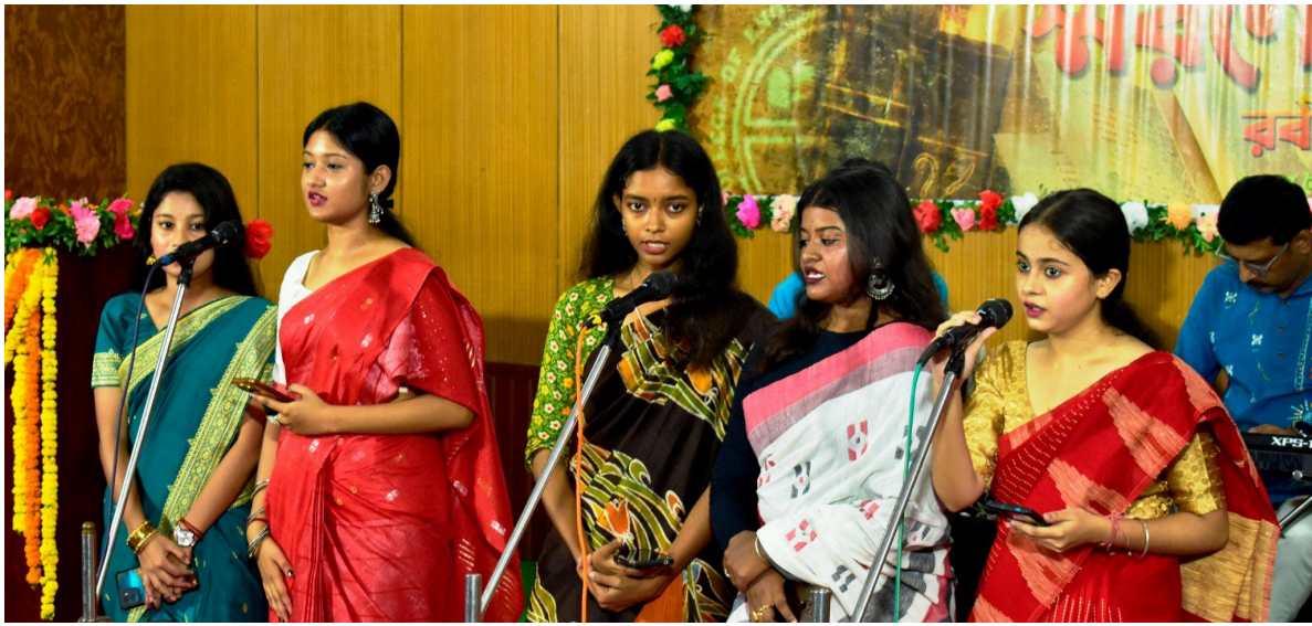
Welcome song by the students