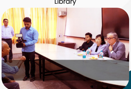
International Placement Conclave