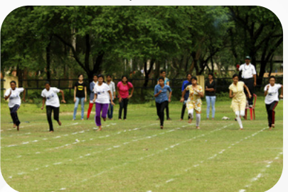
CEMK Sports Event